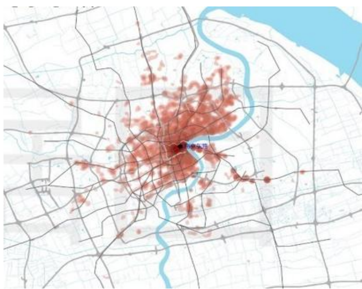
Fig.1. Distribution Chart of Mobile Communication Terminal Equipment of Communication Base Station on Nanjing East Road

Nowadays, mobile phones are the necessities of everybody's life. At the same time, according to the source of mobile phone numbers, it is also very convenient to count the consumption composition of the region. This study combines the mobile phone base station statistics of a mobile communication operator in China. (Shown in Fig.1) [Wang, et. al., 2015]