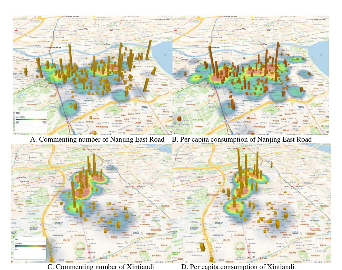
Fig.3 Comparison on Comments and Consumer Numbers between Nanjing East Road and Xintiandi Network Food Ordering